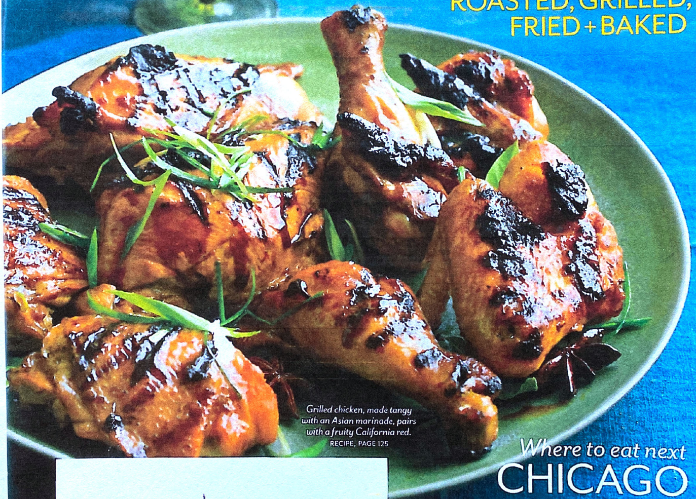
Grilled chicken, made tangy with an Asian marinade, pairs with a fruity California red. RECIPE, PAGE 125